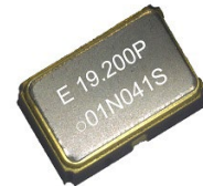
TG-5511CB (4 pins)