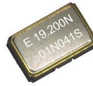
TG-5510CB (10 pins)