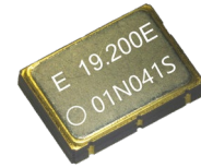
TG7050CMN TG7050SMN (4 pins)