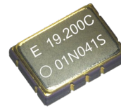
TG7050CKN TG7050SKN (10 pins)